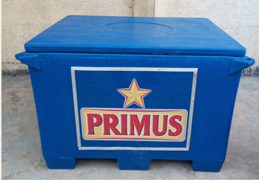
PRINTED ABS SHEET POP RIVETTED