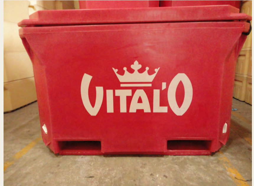
LOGO SCREEN PRINTED