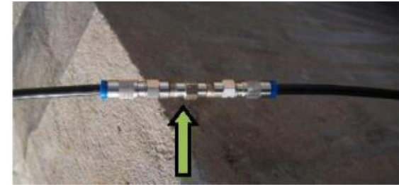
Bare Connector Joint

* Approved by Indus Towers & other Telecom Companies in India.