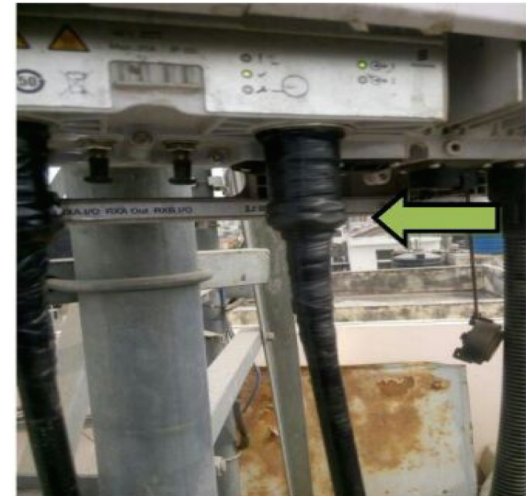
Weather Proofing kit on BTS Connector