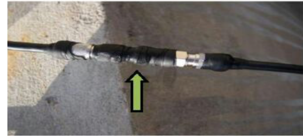
Application of EPR Self-Fusing Tape