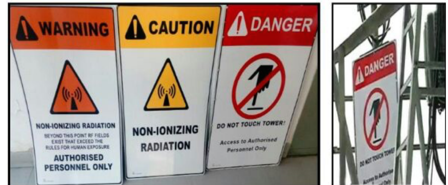
SIGNAGE CAUTION & SAFETY LABELS

* Approved by Indus Towers & other Telecom Companies in India.